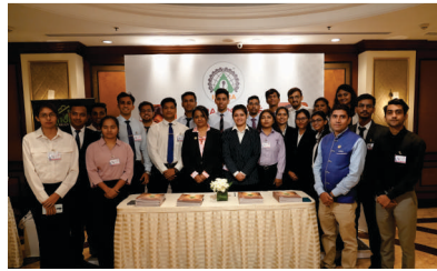
World Marketing Congress