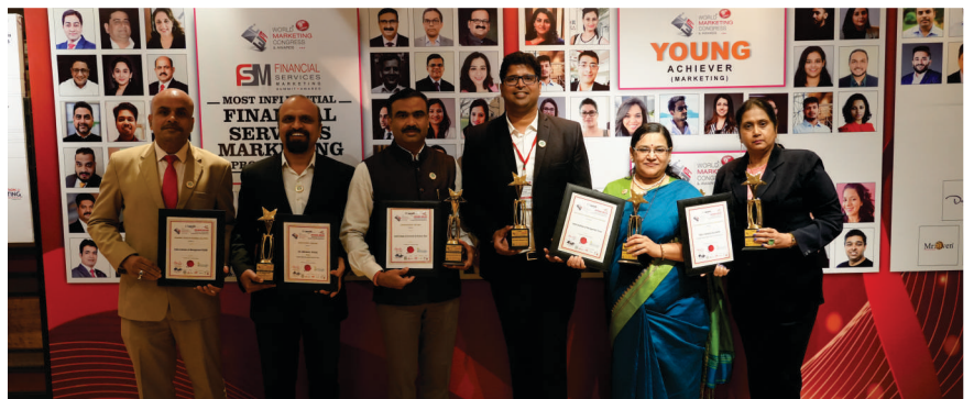
National Education Awards-2022