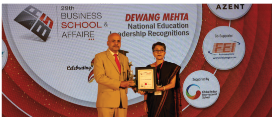
Academic Leader in Business Analytics